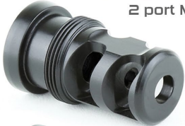
2 port Muzzle Brake