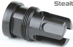
Stealth Flash Hider

Taper Mount Suppressors have many muzzle device options to suit your specific needs. To see available thread pitches see our website.