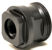
Direct Thread Adapter

PRODUCT LIFETIME LIMITED WARRANTY: Subject to the limitations outlined below, Griffin Armament will repair or replace free of charge any product we manufacture for the duration of this lifetime warranty. This warranty is unlimited in duration and covers at Griffin Armament's sole discretion, service, repair, and/or replacement of damaged products caused by normal use. Any repair not covered by the warranty will be billed at a maximum of 30% of current MSRP for a comparable product, subject to BATFE transfer fees as required.