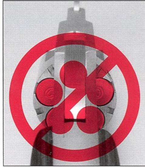
No-Hammer on live cartridge