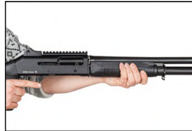
2) Slide The fore-end off the magazine tube