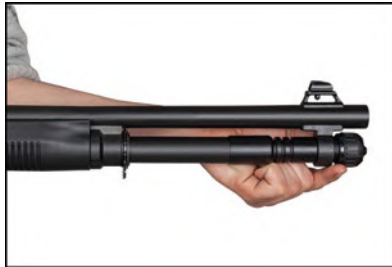
1) Unscrew the fore-end cap

MANUFACTURERS WARNING: THIS MANUFACTURED FIREARM WAS DESIGNED TO PERFORM WITH ITS ORIGINAL PARTS. IT IS YOUR RESPONSIBILITY TO MAKE SURE THAT ANY PARTS YOU BUY ARE AUTHENTIC AND CORRECTLY INSTALLED AND THAT THE PARTS HAVE NOT BEEN ALTERED OR CHANGED. IT IS IMPERATIVE THAT ONLY FACTORY PARTS BE USED AS REPLACEMENTS TO ASSURE THAT THE FIREARM REMAINS FUNCTIONALLY SAFE AND OPERATES ACCURATELY. THE GUN OWNER ACCEPTS FULL RESPONSIBILITY FOR THE CORRECT REASSEMBLY AND FUNCTIONING OF THE FIREARM AFTER ANY DISASSEMBLY OR REPLACEMENT OF PARTS.