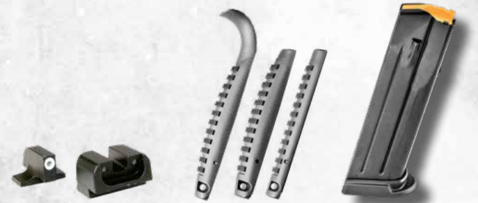
FN 509® NIGHT SIGHT SET